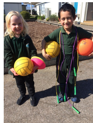
Two little helpers

Contact information: office@whangamata.school.nz