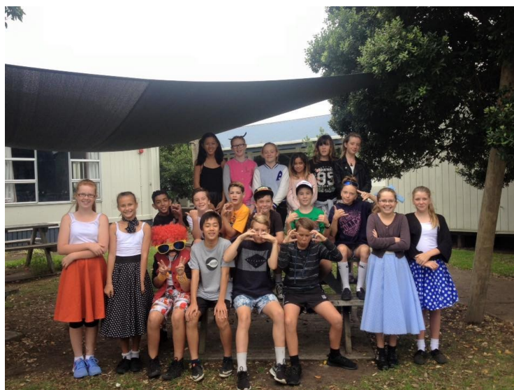
Looking good!! Year 7/8 IF/ RS

It was great to see so many dressed up in their "Vintage" Beach Hop inspired clothing on Friday. The students loved watching the Thunder Cruise on their way to Onemana. Our students were a pleasure to take out of school.